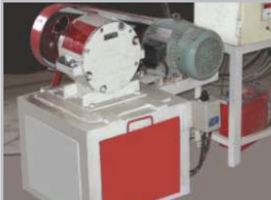
ON LINE STRIP GRINDER